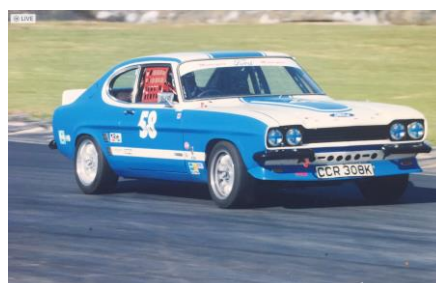
This is a 1971 Ford Capri 3 litre built by Alan. It is a full race spec classic saloon car, which he raced extensively around the country.