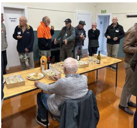
The mate ship of the Shed is epitomized in this photo of smoko time – the circle of life!

Construction of the bird hide sculpture awaits paperwork from Council. An appropriate welder has been confirmed, and progress will be monitored by engineers from Auckland.