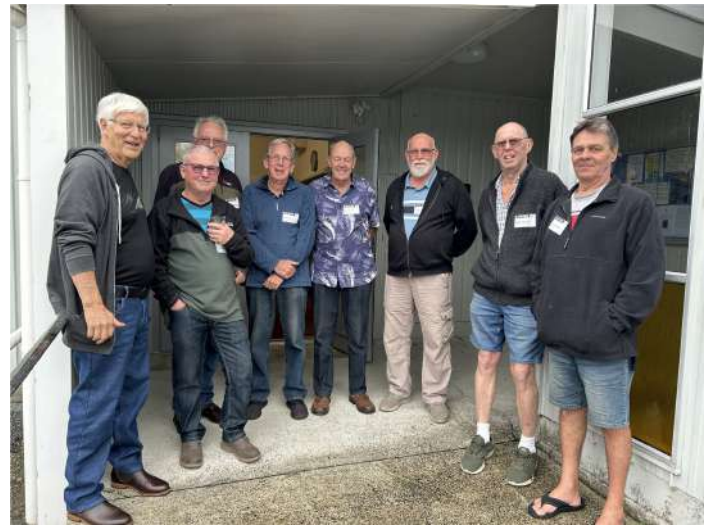
The Committee members who were all re-elected