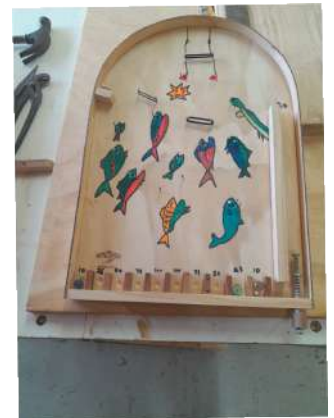
A pin ball game made by the students nears completion – each one is different, designed by the maker