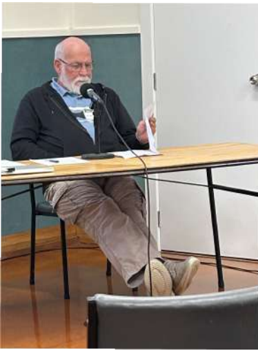
The President ponders the meeting ahead.